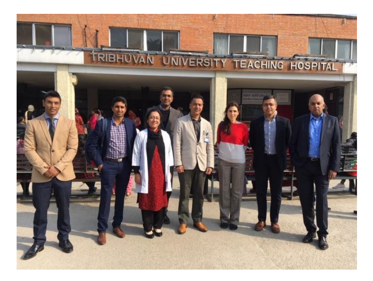
Visit to Tribhuvan University Teaching Hospital