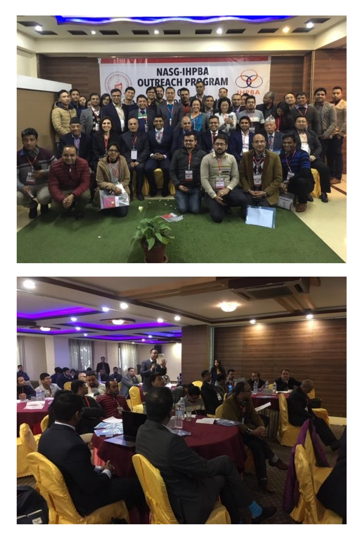
Joint NASG & IHPBA meeting participants and lively discussions